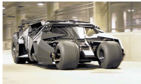
15 Lower Wacker Drive The street below a street sets the scene for a street chase sequence in the Batmobile.

500 N. Franklin St. 300 E. Wacker Dr. 100 N. Wells St. 200 N. Post Place 4700 W. Lake St. 200 S. LaSalle St. 200 S. Wacker Dr. 231 S. LaSalle St.