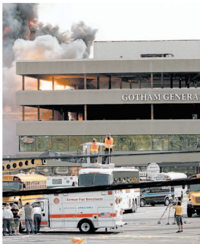
12 Brach's Candy building 401 N. CICERO AVE. Plays Gotham Hospital.