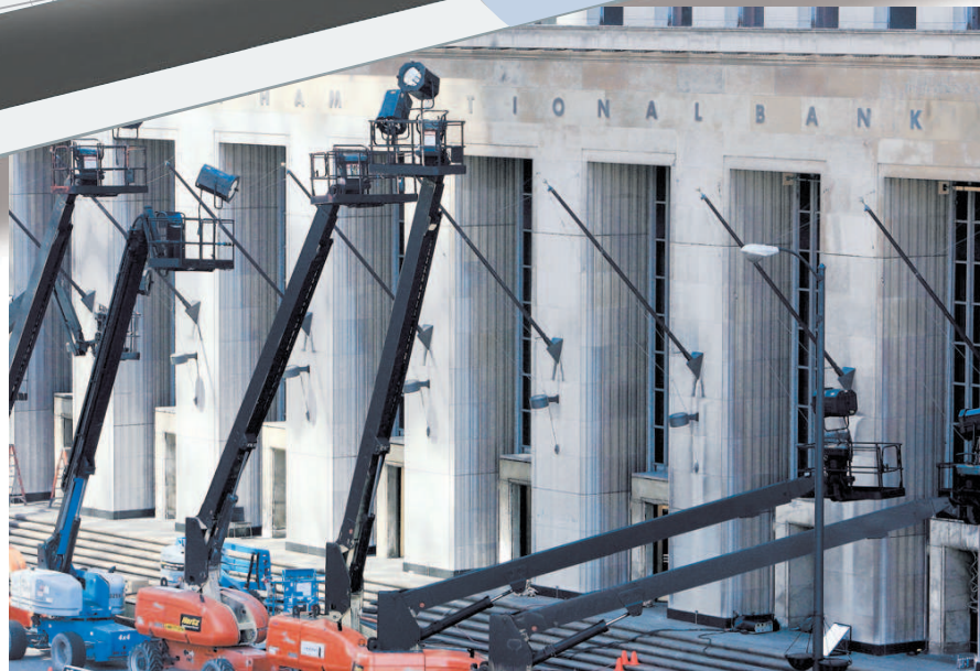
7 Old Chicago Post Office 433 W. VAN BUREN ST. Plays the bank robbed by The Joker.