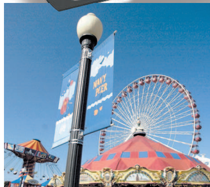
1 Navy Pier 700 E. GRAND AVE. Used in panic scene. Residents are evacuated on ferries.

[ SOURCES: CHICAGO FILM OFFICE, "THE DARK KNIGHT" PRODUCTION NOTES ]