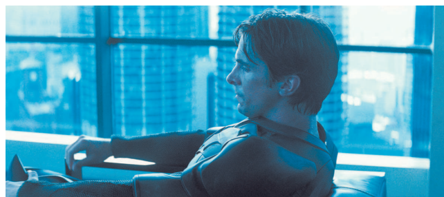
4 Hotel 71 71 E. Wacker Dr. Bruce Wayne's bedroom was built on the 39th floor.